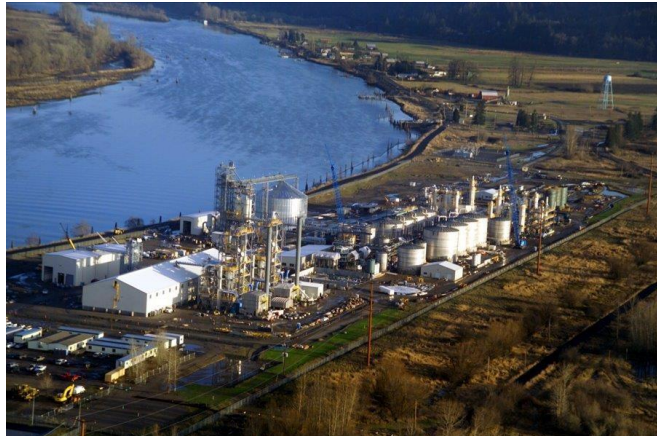
Columbia Pacific Bio-Refinery