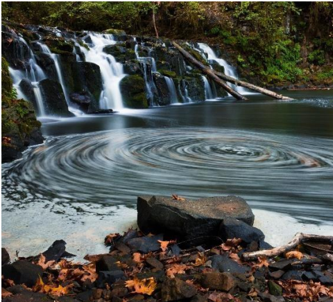
Twin Falls-Clatskanie, Oregon

REGULATIONS HAS CREATED AN $11,000,000,000 OPPORTUNITY