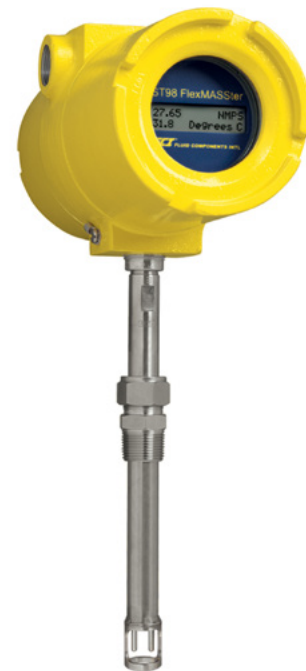
Figure 2: FCI Model ST98 flow meter

The meter is also available with an optional digital readout, which was selected by the plant's process engineers for easy technician access to data. The meter's handy local or remote