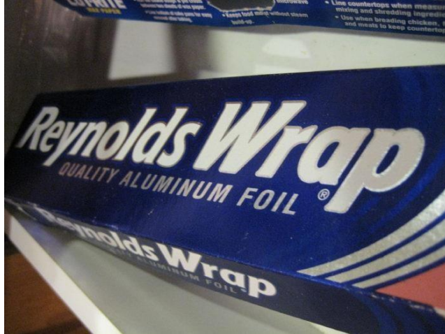
Churchill Downs Louisville, Kentucky Reynolds Foil Plant

Have you ever heard of Churchill Downs-The Kentucky Derby?