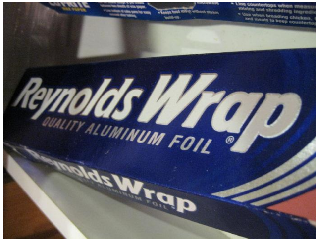
Churchill Downs Louisville, Kentucky Reynolds Foil Plant

Have you ever heard of Churchill Downs-The Kentucky Derby?