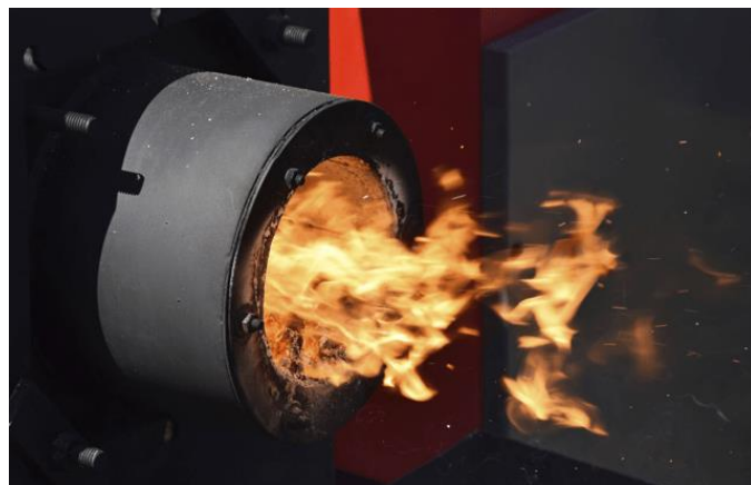
Figure 4: ECOM Flue Gas Analyzers for NOx measurement for every coverage.

The term “Low NOx” commonly refers to NOx emissions levels below 500 ppm, but certain regulations require emissions to be below 10 ppm. At these low levels, it is imperative to measure True NOx (i.e., NO + NO 2 ) to reduce the error, as a few ppm accounts for a significant portion of the NOx emissions. A resolution of 0.1 ppm is often needed at these low levels to increase accuracy when measuring.