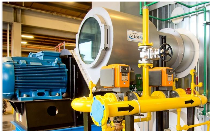
Figure 3: The VISION Burner technology ensures complete and efficient combustion with very low emissions; < 30 ppm NOx with low FGR rates.

This process allows regulatory agencies to prevent these attempts to falsely reduce reported NOx emissions levels. Emissions from boilers are commonly calculated to a 3% O 2 reference level, and engine emissions are commonly calculated to a 15% O 2 reference level.