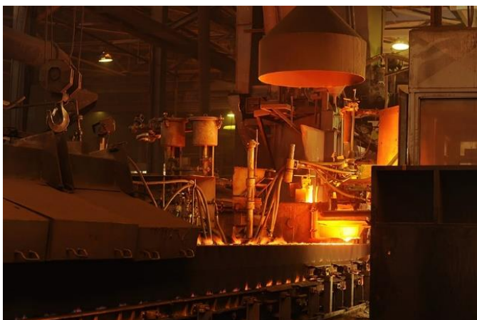
Figure 6: Industrial Process where emissions analyzers make an improvement in burner efficiencies.