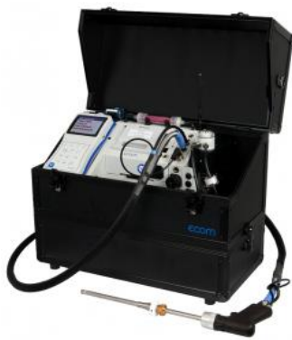
Figure 2: ECOM-J2KN Pro Industrial Emission Analyzer is a state-of-the-art analyzer with both remote and wireless control.

The most common and effective of these techniques involves a cooling system, like a thermoelectric chiller, which rapidly cools and dries the flue gas sample prior to entering the sample hose and the gas analyzer. This measurement method ensures that the NO and NO 2 readings are highly accurate and representative of the NOx emissions being released from the combustion process.