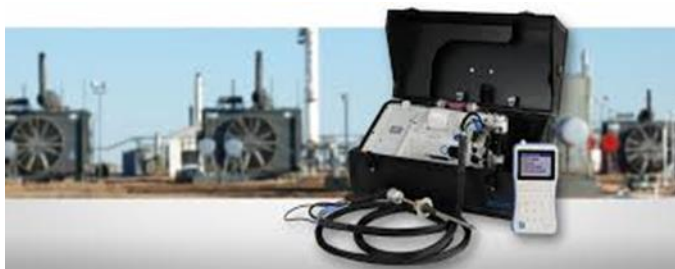
Figure 5: More than 8-gases measurable (Long-life sensors + NDIR) are available on the ECOM Pro Tech Series.